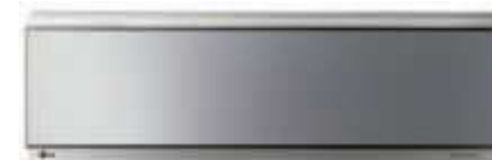
Argento ** V