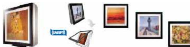
Artcool Panel personalizzabile