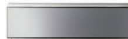
** Argento V